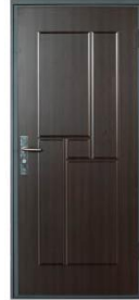
Armoured Entrance Door SLA-007