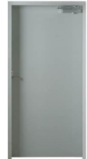
Office Fire Door