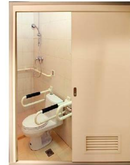
Wash Room Sliding Door