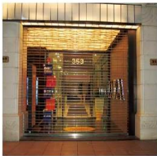
Grid Burglarproof Rolling Shutter