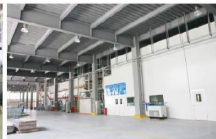
Intelligent Automatic Painting System