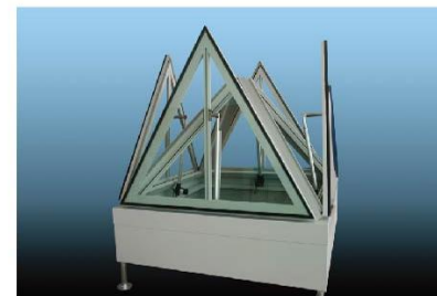
Pyramid Smoke Venting System