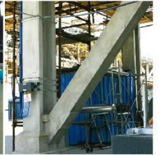
Fireproof Coating (outdoor)