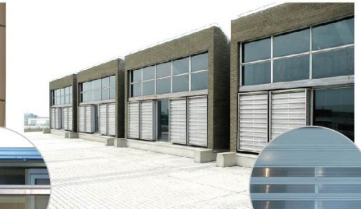
Shutter Type Smoke Venting System