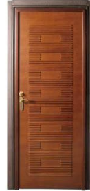
Armoured Entrance Door SLA-008