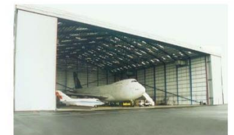
Large Garage Door