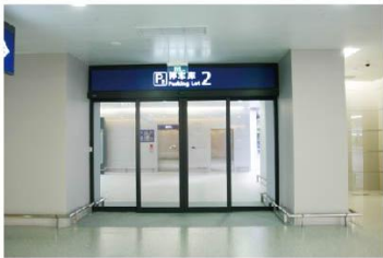
Automatic Induction Door