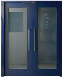
Steel Fireproof Glass Door