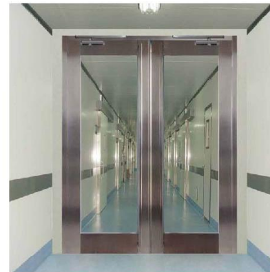
Steel Glass Door