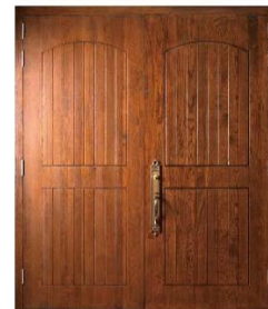
Steel Entrance Door D