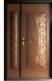
Steel Entrance Door B