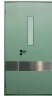
Hospital Door SLH-006