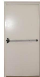
UL Steel Fire Door SLU-01