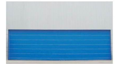
Large Soft Curtain Door