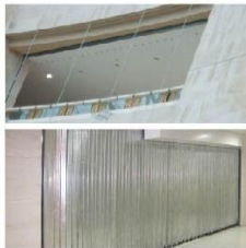
Special Grade Fireproof Rolling Shutter