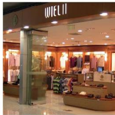
Glass Folding Door