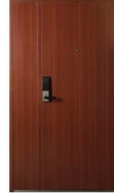
Steel Entrance Door SLJ-005