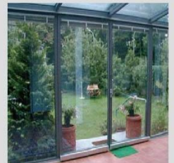
Translational Sliding Door