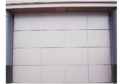
Explosion Venting Wall