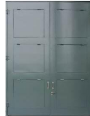
Explosion Venting Door