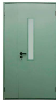
Hospital Door SLH-005