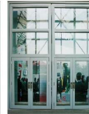
Exhibition Room Door