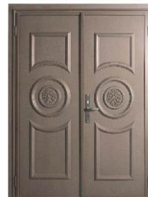
Steel Entrance Door C