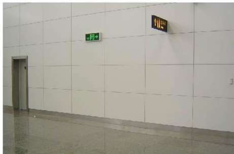
Steel Wall Surface System