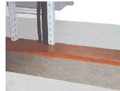
Organic and Inorganic Fire Blocking Material