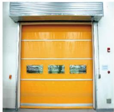
PVC Rapid Roll Up Door