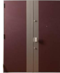
Steel Entrance Door SLJ-003