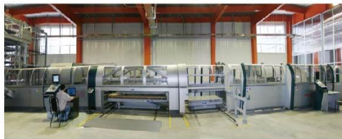
Metal Flexible Machining Pipe Lining