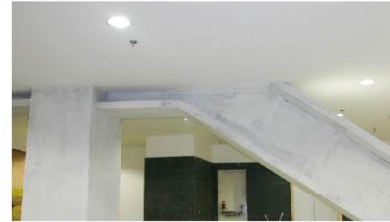
Fireproof Coating (thick)