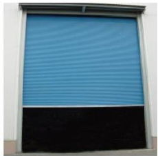
Wind Resistant Rolling Shutter