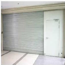
Fireproof Rolling Shutter with Flush Door