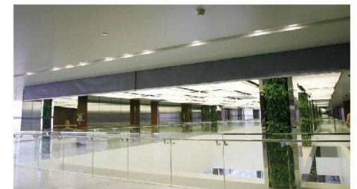
Fixed Smoke Block Hang Wall