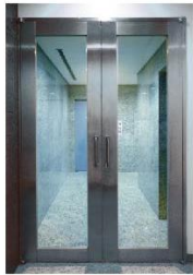
Stainless Steel Glass