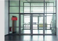
Glass Door and Partition