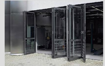
High-grade Folding Door