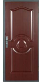
Armoured Entrance Door SLA-003