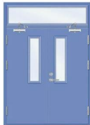
Double Leaf Fire Door