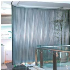
Side Direction Steel Fireproof Rolling Shutter

Steel rolling shutter normally applied to industry and civil construction, industry plant, plaza, shopping mall and basement fireproof dividing areas ,with fireproof function and burglar proof function.