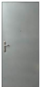
Euro-type Entrance Door SLE-006