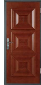
Armoured Entrance Door SLA-006