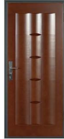
Armoured Entrance Door SLA-002