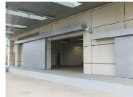
Steel Electric Fence Gate