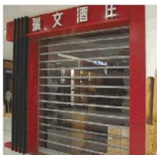
Crystal Burglarproof Rolling Shutter