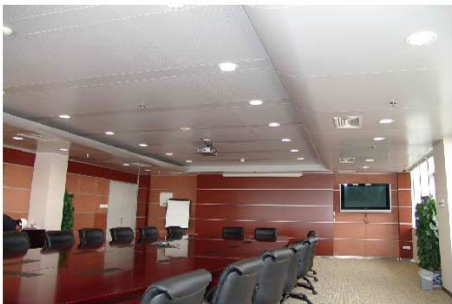
Steel Ceiling System