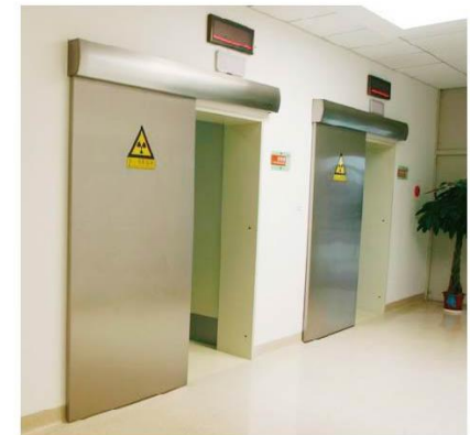
Radiation Resistant Door