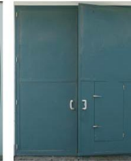
Grain Depot Door