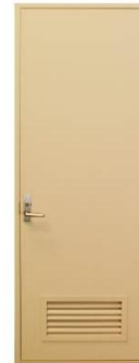
Washroom Flush Door