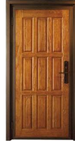
Steel Entrance Door A