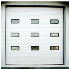
Glass Folding Door