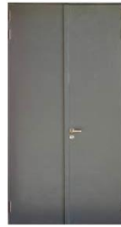
BS Steel Fire Door SLB-02