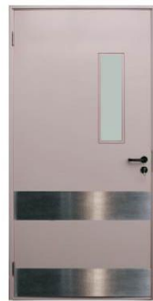
Hospital Door SLH-003