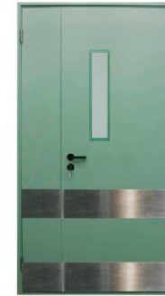
Hospital Door SLH-007