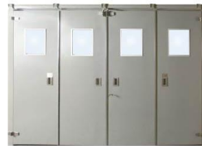
Steel Folding Door