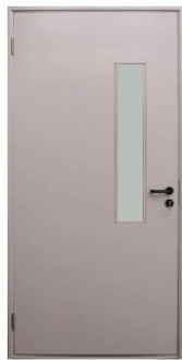
Hospital Door SLH-001

Medical Door now as a special design door has been widely used in the high level and middle high level hospital buildings ,we are full of enthusiasm about design and produce the high quality medical doors to support hospital ,In order to create a more safety, peacefully, cleaner ,health and professional medical treatment environment.