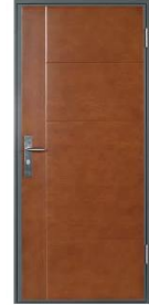
Armoured Entrance Door SLA-001