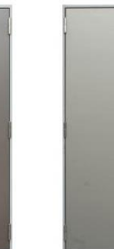
Steel Entrance Door SLJ-002