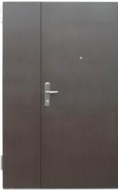
Euro-type Entrance Door SLE-005