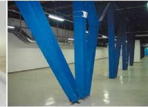
Fireproof Coating (thin)