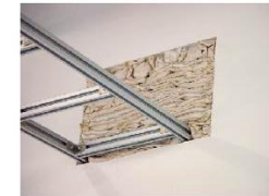
Fire resistant bag