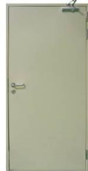
WH Steel Fire Door SLW-01