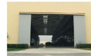
Large Sliding Door