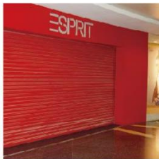
Steel Painted Rolling Shutter