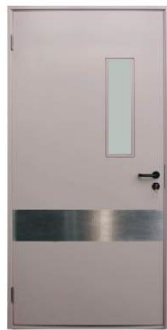
Hospital Door SLH-002