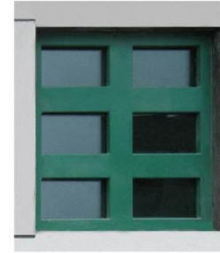
Blast Resistant Window