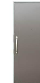
Steel Entrance Door SLJ-001