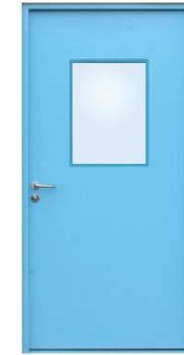
Consulting Room Door