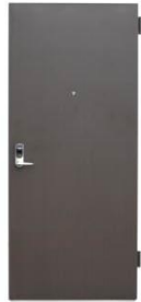
Euro-type Entrance Door SLE-003