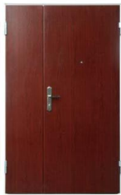
Euro-type Entrance Door SLE-002