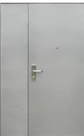
Euro-type Entrance Door SLE-007