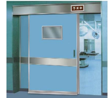
Operating Room Door