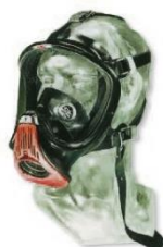
PKI 9310 Breathing Mask