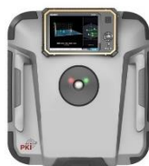
PKI 7575 3D Through Wall Radar