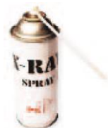
PKI 9400 X-Ray Spray