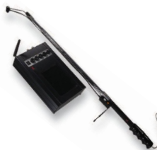
PKI 8110 Telescopic Inspection Camera for Day and Night Observation and Recording