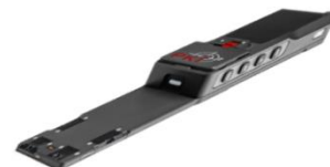
PKI 8050 Ultracam Videoscope Receiver