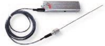
PKI 2470 Needle Microphone with Amplifier