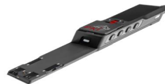
PKI 8050 Ultracam Videoscope