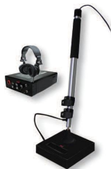
PKI 8270 IED / RCIED Detector