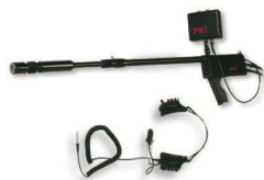
PKI 8155 Super Probe