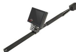
PKI 8125 Video Stick Camera