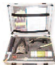
PKI 9530 Car ID Set