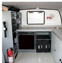
PKI 9380 Forensic Vehicle Laboratory