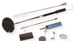
PKI 8055 Control Mirrors