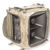
PKI 9340 Acoustic Hailing Device