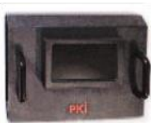
PKI 7405 Radar Observation System