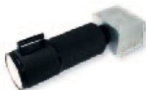
PKI 5070 Telephoto Recorder