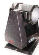
PKI 7565 Computer Controlled Military Searchlight