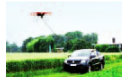
PKI 2470 Video Drone with Unlimited Flying Time