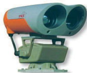
PKI 5675 Outdoor Fire Detection System