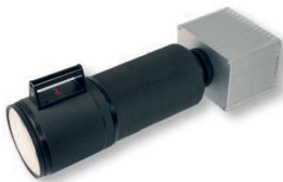
PKI 5070 Telephoto Recorder