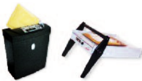
PKI 7130 Letter Bomb Detector