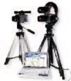
PKI 3100 Laser Monitoring System