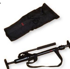
PKI 9105 Hydraulic Jamb Spreader