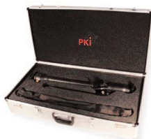
PKI 9180 Hydraulic Door Opener