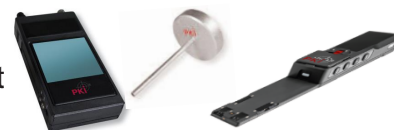
PKI 8085 Audio/ Videoscope Cameraset