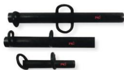
PKI 9110 Series of Door Rams