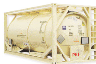
PKI 9055 Drinking Water Container