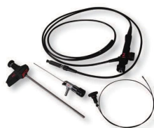
PKI 8020 Flexible Fiberscope