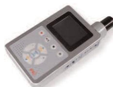
PKI 8275 Chemical Handheld Detector