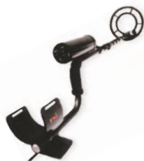
PKI 8565 Underwater Metal Detector