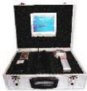
PKI 5900 Submarine Video Camera