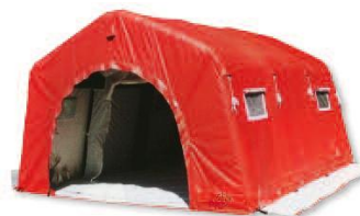
PKI 9335 Quick Operation Tent