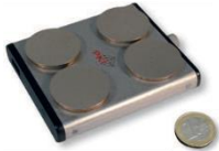
PKI 2180 Professional Quadro Stethoscope Recorder