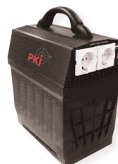
PKI 8005 Mobile Power Station