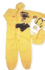
PKI 9165 Emergency Set