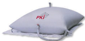
PKI 9060 Foldable Drinking Water Tank