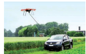
PKI 5625 Video Drone with Unlimited Flying Time