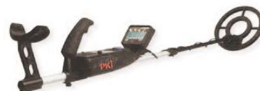
PKI 8230 Top Quality Metal Detector