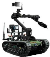
PKI 7550 Modular EOD / IEDD Robot