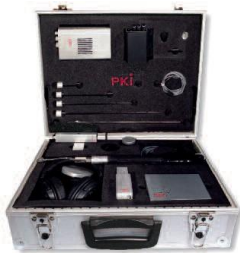
PKI 2515 Tactical Audio Microphone Set