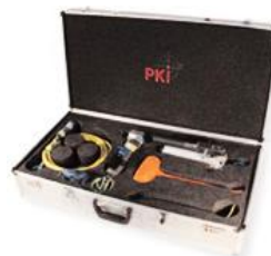
PKI 9175 Hydraulics Door Opener