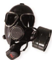
PKI 9170 Gas Mask