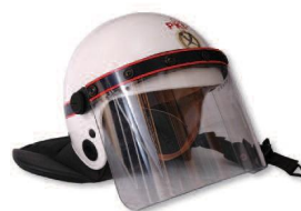
PKI 9200 Protective Police Helmet