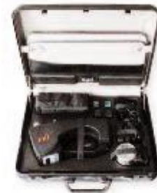
PKI 7300 Handheld Explosive Detector